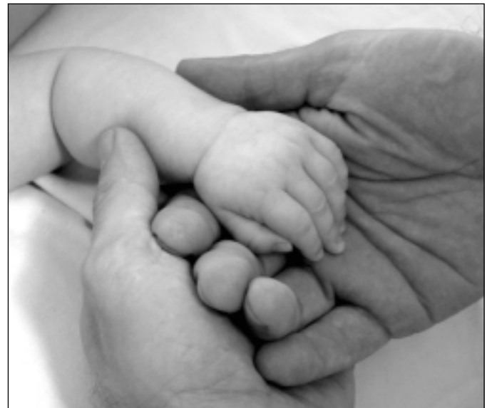
Father and Child

that the meaning of the man's guardianship over the woman is that the command should rest with him, but it should be a command borne out of companionship and not domination and control. Thus she can answer back